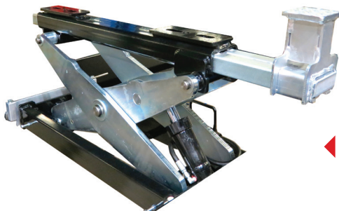
Rolling Air Hydraulic Jacks #TLS-RJ15