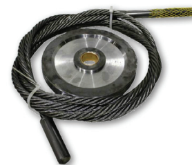
13" / 330 mm Machined Pulleys with 5/8" / 15.9mm Cables