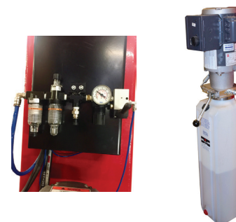
North American Power Unit / Air Mechanical Locking System with Regulator