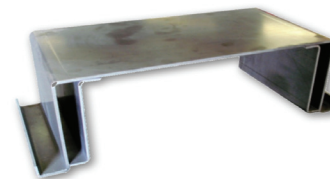
24" / 610mm Double Wall Non Sag Runways