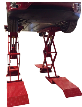
▲ Retractable Pull Decks 82.7" / 2100mm