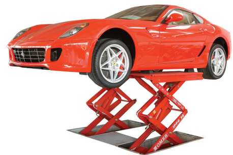
▲ Flush or Surface Mounted