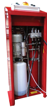
▲ Volumetric Control