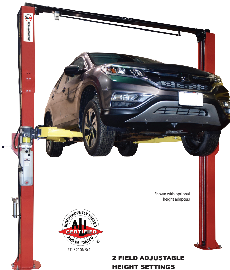
Shown with optional height adapters