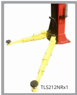
3 piece, offset arms front & rear "Flexmetric" style asymmetric or symmetric loading