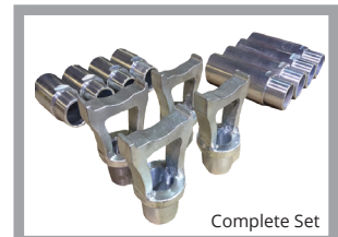
Height Adapters #TLS2PTA4-2