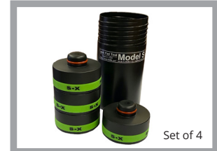
TESLA lift adapters S&X models #TLS2PMDS-X