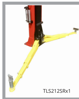
3 piece straight front & rear "Symmetric" arms for trucks & longer vehicles