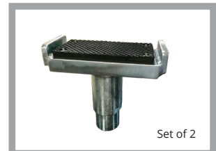
GM Truck 7" (177.8mm) Pads #TLSGMTA