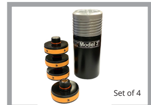
TESLA lift adapters model 3 #TLS2PMD3