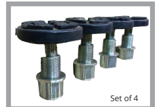
Drop in screw adjustment style lifting pads