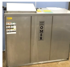
Nema 4 water resistant stainless steel control console