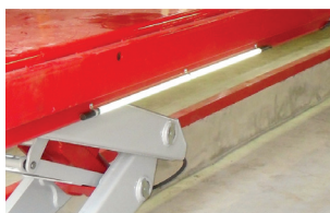
Optional Shatterproof LED 24v Runway lighting