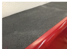
Silica based anti slip runway traction surface