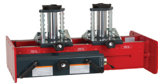
26,400 lb. (12T), 35,200 lb. (16T) & 44,000 lb. (20T) air hydraulic heavy duty jacking beams