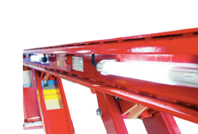
Optional Shatterproof Fluorescent or LED 24v Runway lighting