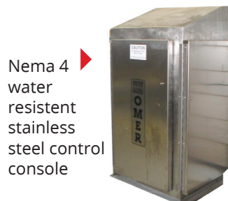
Nema 4 water resistant stainless steel control console