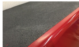
Silica based anti slip runway traction surface