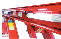
Optional Shatterproof Fluorescent or LED 24v Runway lighting