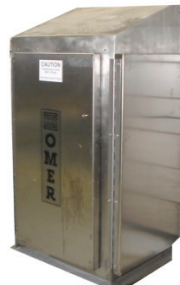
Nema 4 water resistant stainless steel control console