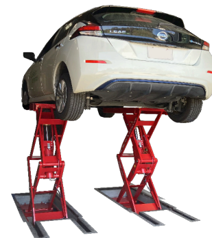
FLUSH OR SURFACE MOUNTED