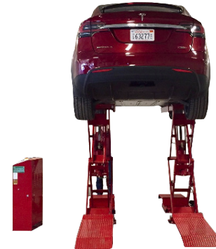
RETRACTABLE PULL DECKS 82.7" / 2100MM